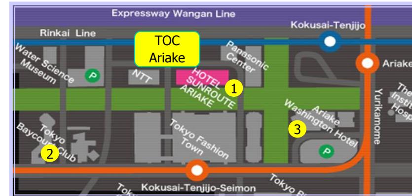
Map: Near TOC Ariake and Hotels (Numbers refer to hotels on the list)